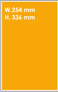
1 page or inside front cover