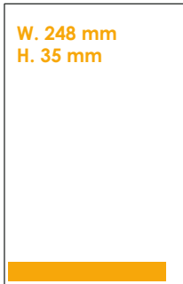
Cover banner 70