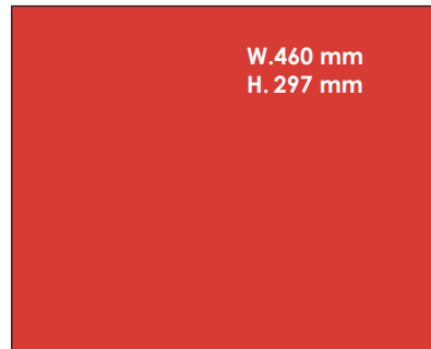
Double Page Trim size

FINAL SIZE OF THE MAGAZINE (WxL) : 230 x 297 PERFECT BOUND