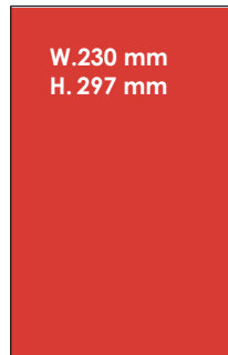
Full Page Trim size