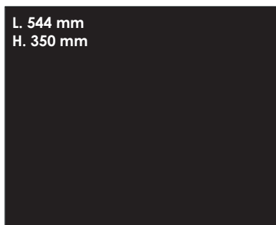
Double Full Page