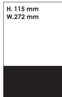
1/3 Page Width