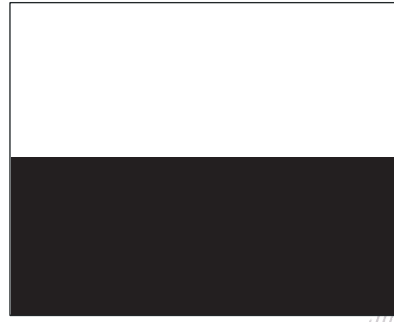
Double 1/2 Page