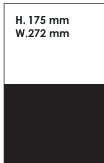
1/2 Page Width