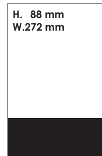
1/4 Page Banner