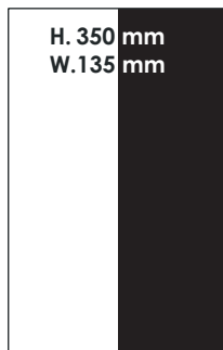
1/2 Page Height