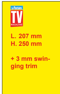
Star in the front page